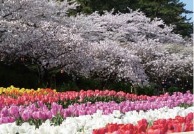
Hamamatsu / Lake Hamana