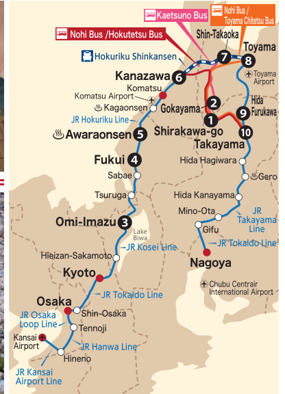
Image of usable routes of JR train, bus and sightseeing spots. Separate admission and access fees to the attraction shown in the diagram may be required.

✓ Use of reserved seats on ordinary trains of JR conventional lines are free of charge up to 4 times! (Excluding Limited Express "HARUKA") Unlimited rides on Hokuriku Shinkansen (non-reserved seats) between Kanazawa -Toyama!